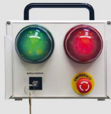
Safety equipment in accordance with BGI 891 and VDE 0104